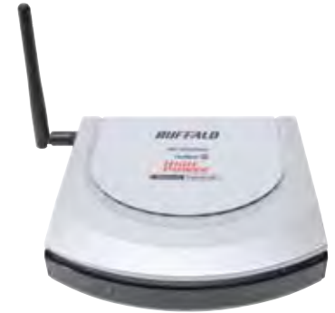
Wireless-G MIMO Performance* Ethernet Converter

The Buffalo Wireless-G MIMO Performance* High Power Ethernet Converter is an extremely versatile Wireless client adapter. Use it to Wirelessly connect gaming consoles, desktops, notebooks, media players, printers, Unix workstations, and any other devices with Ethernet ports. With a built-in four port switch, up to 4 devices can be simultaneously connected to the Ethernet Converter for instant Wireless connectivity. Once the simple browser-based set-up or AOSS™ is complete, the Ethernet Converter can be moved from one device to another without reconfiguration. When combined with Wireless-G MIMO Performance* WHR-HP-G54 router, you can extend the range by up to 3X and improves overall performance by up to 6X of standard 802.11g.